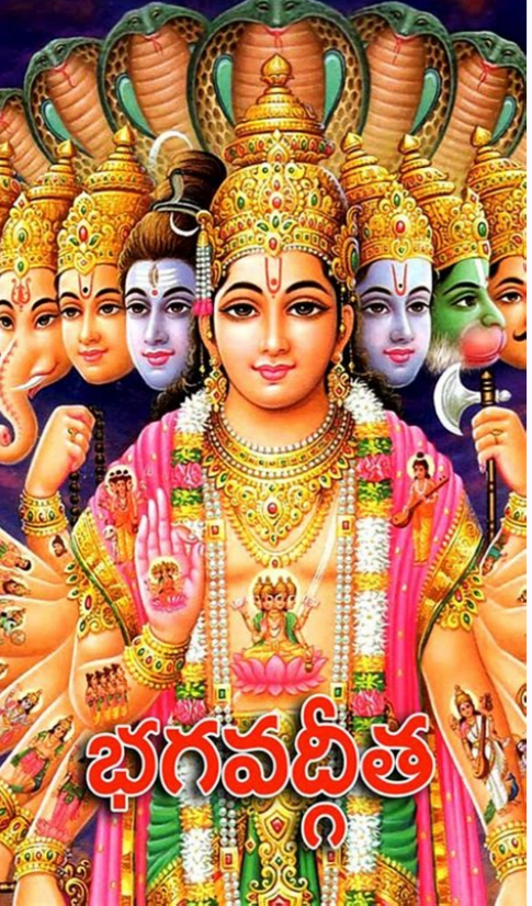
Bhagavad gita lyrics in kannada pdf. Bhagavad gita in kannada free download.